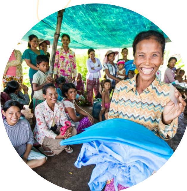
Distribution of insecticide-treated nets in Prongyeang, Cambodia.

2022 is a tipping moment. Another moment of global solidarity is needed to get the progress against the three diseases back on track, or the vital gains achieved over the past 20 years will be lost. In this context, the EC's longstanding partnership with the Global Fund is more critical than ever. The European Commission must demonstrate leadership again and do whatever it takes to end HIV, TB and malaria as public health threats, save lives, and accelerate progress towards universal health coverage.